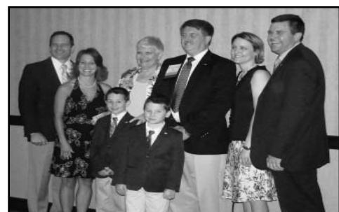
The Cordill Family

The National Propane Gas Association is the national trade association of the propane industry. NPGA represents approximately 3,500 companies, including producers, wholesalers, transporters, and retailers of propane gas as well as the manufacturers and distributors of associated propane equipment and appliances. Fifty million Americans choose propane as their energy source. For more information about NPGA and the propane gas industry, visit NPGA on the Internet at www.npga.org .